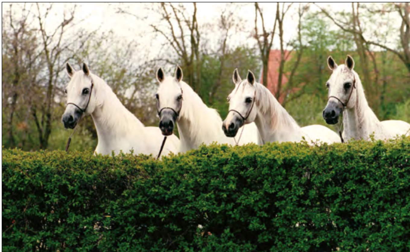
Emilda, Emanacja, Emigrantka, Emigracja

Junior Filly, 1998 All Nations Cup Champion Senior Mare as well as 1999 Polish National Champion Senior Mare and Best in Show, EMANACJA blessed Michałów with some outstanding offspring. Like her dam, she was the mother of mares. Her firstborn filly EMILDA 1990 (by Pamir 1984) was 1992 Polish National Champion Junior Filly, 1996 and 1997 Polish National Reserve Champion Senior Mare, 1999 All Nations Cup Reserve Champion Senior Mare and 2000 UK National Champion Senior Mare. Before being sold to Halsdon Arabians in 1998 for 200 000 USD, EMILDA left in Michałów two extraordinary grey fillies by MONOGRAMM 1985, EMBRA 1995 and EMMONA 1998. EMBRA, the 2009