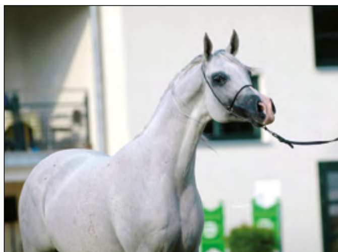
Emmona (Monogramm x Emilda)