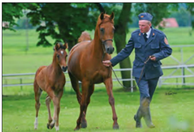
Ekliptyka with Equator

Another crossing of EUKALIPTUS with EMIGRACJA produced the fabulous ERLANDA 1990, 1994 International Champion Senior Mare and Best in Show in Babolna as well as 1995 Polish National Reserve Champion Senior Mare. Her only progeny was the painting-like precious ELANDRA 1995 (by Monogramm), sold to the USA for the record price of the 2005 Pride of Poland auction, 290 000 EUR. She surely made her new owner happy by becoming Scottsdale Champion Senior Mare and US National Reserve Champion Senior Mare two years after the sale.