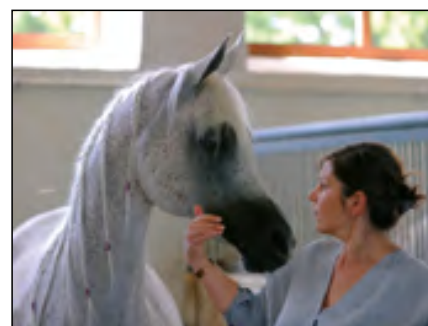
Author of the article with one of the most decorated mares of our times - Emandoria

bred by Janów Podlaski, Michałów and Białka Stud to a large extent have shaped the Arabian horse as we know it today. Therefore, it is of utmost importance to preserve this priceless heritage and to protect the bewitching beauty of the Polish mares that reaches beyond borders. To be continued... ♦