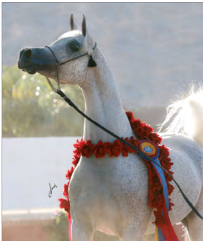
Perfinka (Esparto x Perfirka)