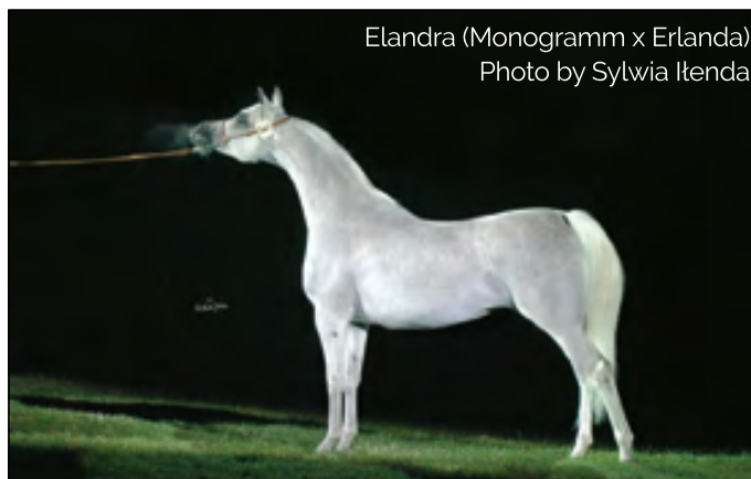
Elandra (Monogramm x Erlanda)