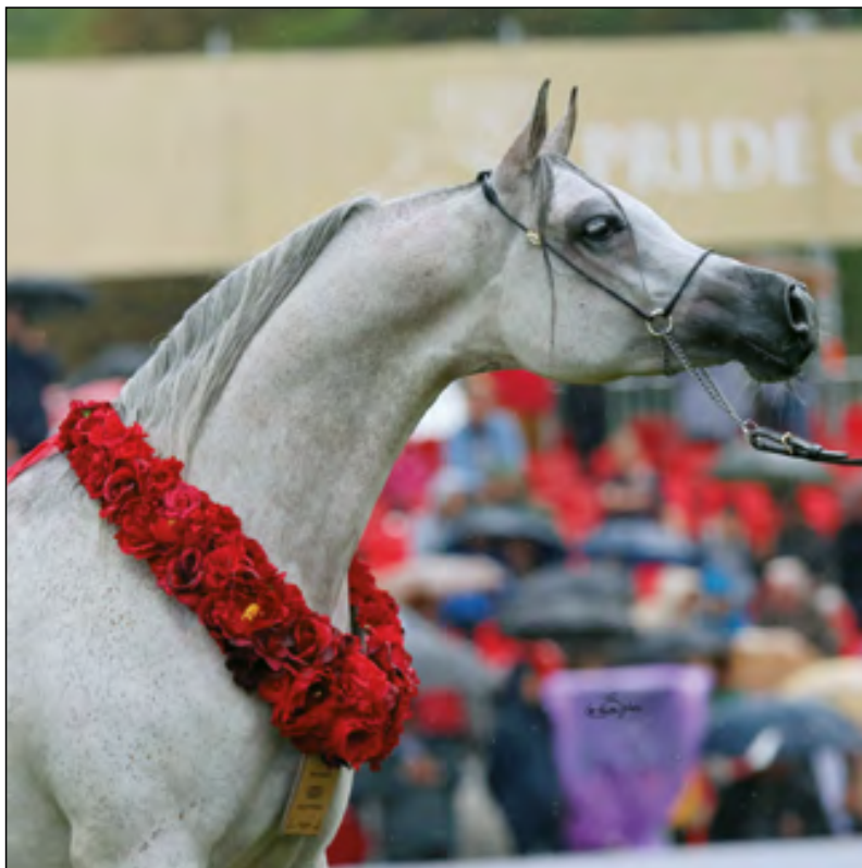
Perfinka (Esparto x Perfirka) - Janów Podlaski 2012

Senior Mare, 2019 Sharjah International Gold Champion Senior Mare, 2019 Dubai International Gold Champion Senior Mare, 2019 Gold Champion Senior Mare at King Abdulaziz Arabian Horse Centre Show and 2020 Gold Champion Senior Mare at Prince Sultan Bin Abdulaziz International Arabian Horse Festival. PEPITA's son PITAWAL 2013 (by Kahil Al Shaqab) has had a pretty impressive show career himself, also winning several titles: 2014 Białka Junior Spring Show Silver Champion Yearling Colt, 2014 Polish National Silver Champion Junior Colt, 2015 Białka Junior Spring Show Bronze Champion Junior Colt, 2015 Prague InterCup Bronze Champion Junior Colt, 2019 Polish National Silver Champion Senior Stallion and 2021 Silver