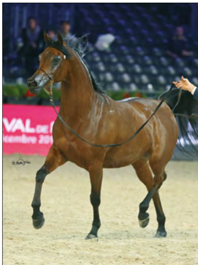
Pinga (Gazal Al Shaqab x Pilar) - Paris 2015