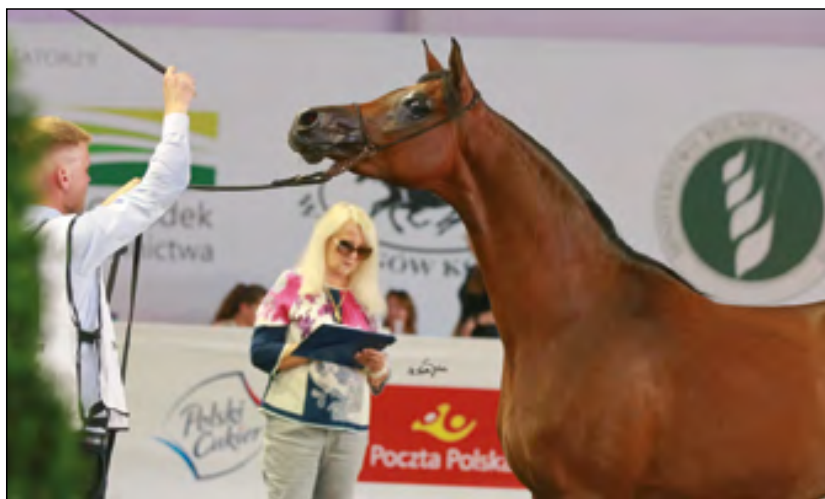
Petula (Kahil Al Shaqab x Pinga)

the 2001 World Champion Stallion, GAZAL AL SHAQAB, and a great-granddaughter of the 1983 World Champion Mare, PILARKA. PINGA's dam, PILAR 1996, was the highest selling horse of the 2010 Pride of Poland auction, fetching the price of 240 000 EUR from the Qatari Al Shaqab Stud, the owner of GAZAL AL SHAQAB as well as the whole dynasty of sires stemming from this superb stallion. As a yearling filly, after a quick warm-up at the local Polish shows in Falborek and Bełżyce, PINGA became