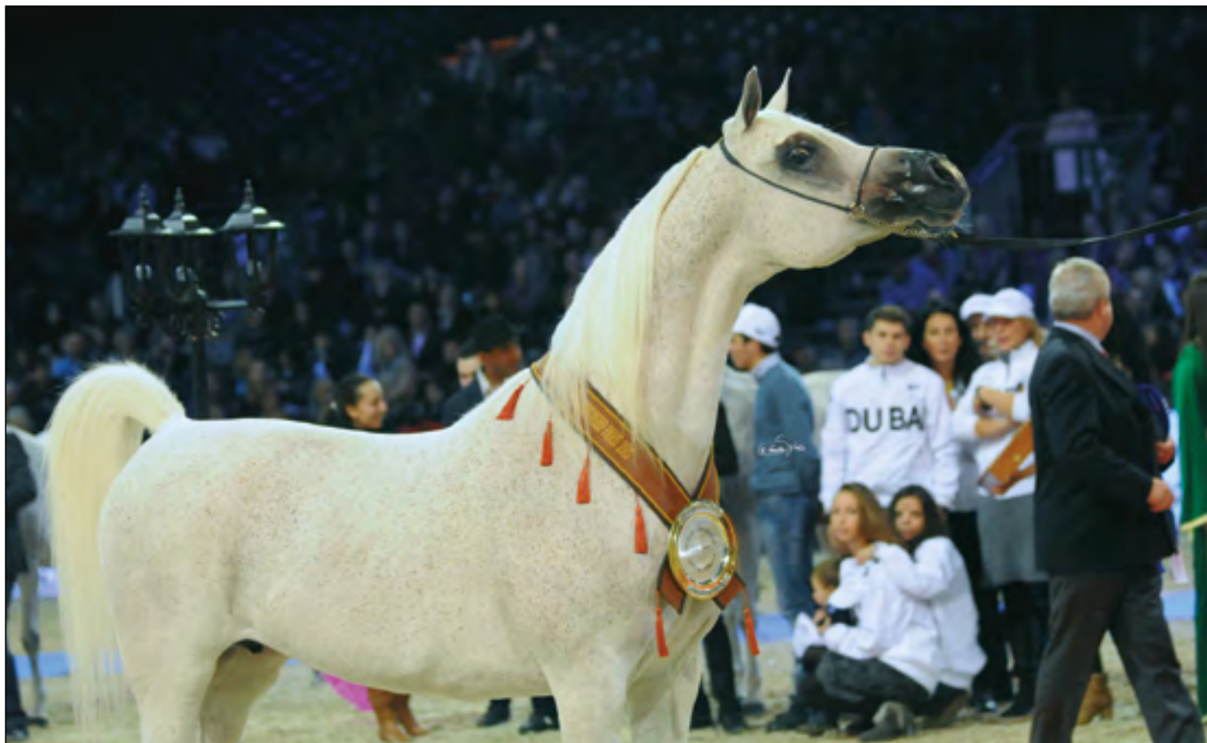
El Dorada (Sanadik El Shaklan x Emigrantka) - Paris 2012.

Reserve Champion Senior Stallion, 2001 European Champion Senior Stallion and 2002 Polish National Champion Senior Stallion, as well as an equally celebrated mare, EL DORADA 1998 (by Sanadik El Shaklan 1983), whose countless titles include: 2000 Polish National Champion Junior Filly, 2000 European Champion Junior Filly, 2002 Polish National Champion Senior Mare, 2002 All Nations Cup Champion Senior Mare, 2002 European Reserve Champion Senior Mare, 2004 European Champion Senior Mare, 2004 World Reserve Champion Senior Mare, 2006 Scottsdale Reserve Champion Senior Mare, 2006 US National Champion Senior Mare, 2012 All Nations Cup Silver Champion Senior Mare, 2012