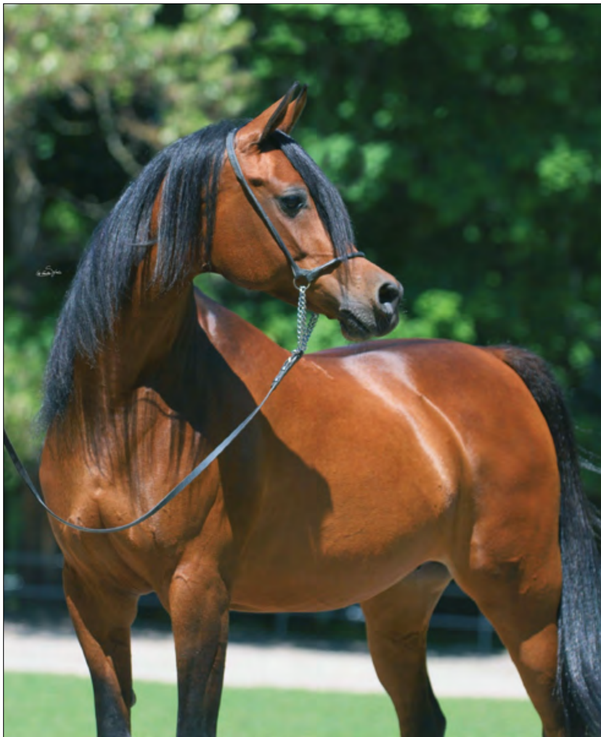
Pianissima (Gazal Al Shaqab x Pianosa)