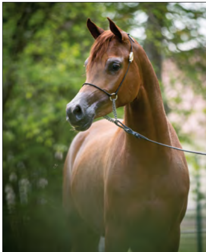
El Bellisima (Ascot DD x Ekliptyka)