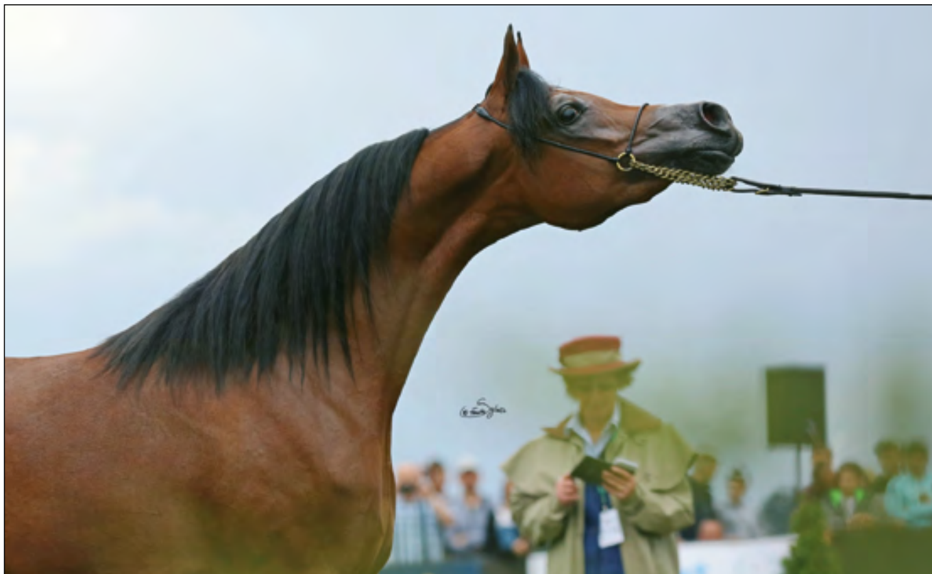
Pamina (Pogrom x Pianissima)

National Silver Champion Senior Stallion. In 2018, EQUATOR competed in the Middle East, winning silver medal in Dubai and gold medal in Sharjah. It is hard to find a more spectacular show career than the one of EQUATOR and his younger maternal half-sister, EL BELLISIMA 2017 (by Ascot DD 2011), stays in his shadow for now, having won 'just' three medals, two silvers and one bronze, at the Polish Nationals.