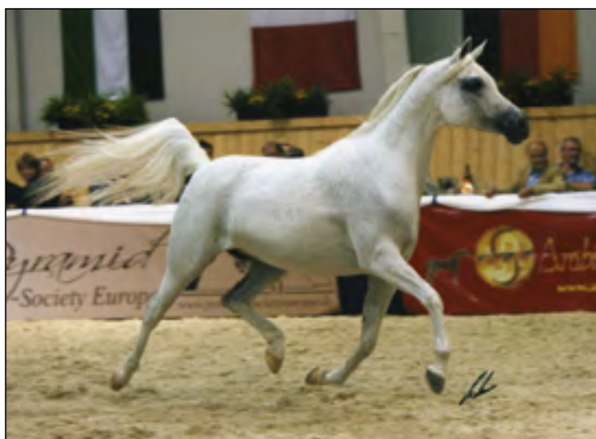
El Dorada (Sanadik El Shaklan x Emigrantka) - Aachen 2007