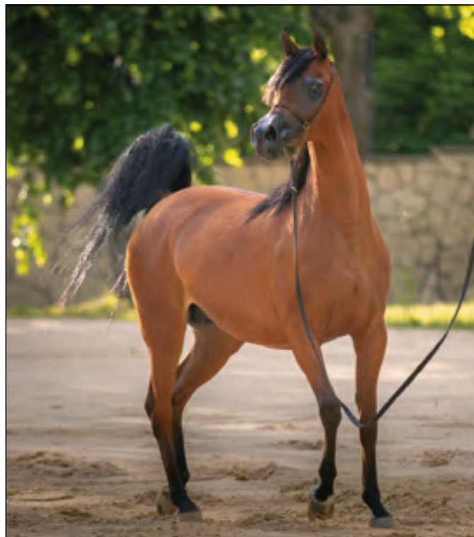
Esmeraldia (QR Marc x Emandoria)