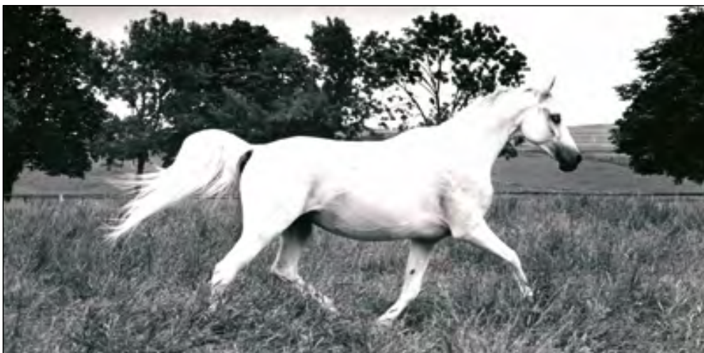
Estebna (Nabor x Estokada)