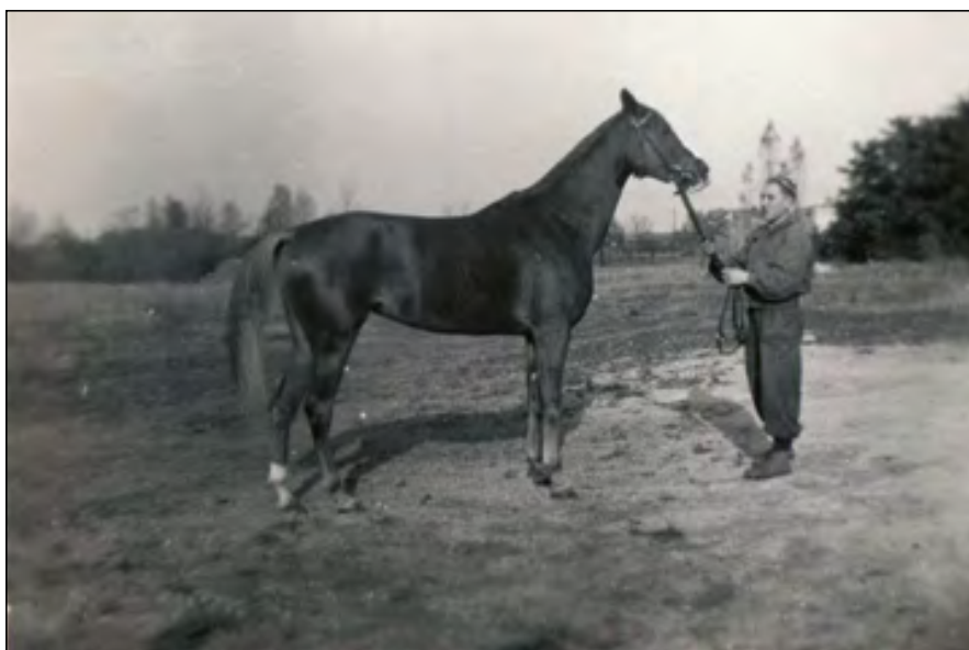
ESTOKADA 1951 (Amurath Sahib x Saga)

The meritorious dam line of MILORDKA, better known as the champion producing 'E' line, is one of the most numerous and highly valued Arabian families not only in Poland but also in the world. Originated in 1810 in the Princes Sanguszek's Stud of Sławuta, the family is nowadays represented mainly in Michałów State Stud and it has become their trademark in the recent years. The snow-white or flea-bitten, and more recently also bay, representatives of 'E' line have been among the most sought-after broodmares in the world due to their extreme femininity,