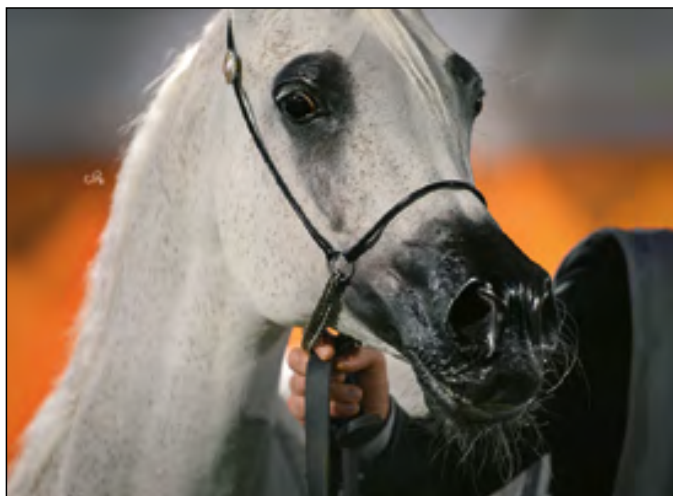
Pepita (Ekstern x Pepesza)