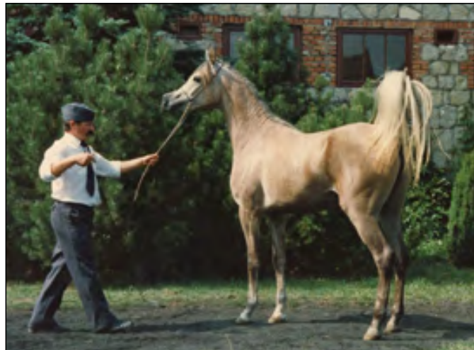
Estdarda (Gadir x Estandja)