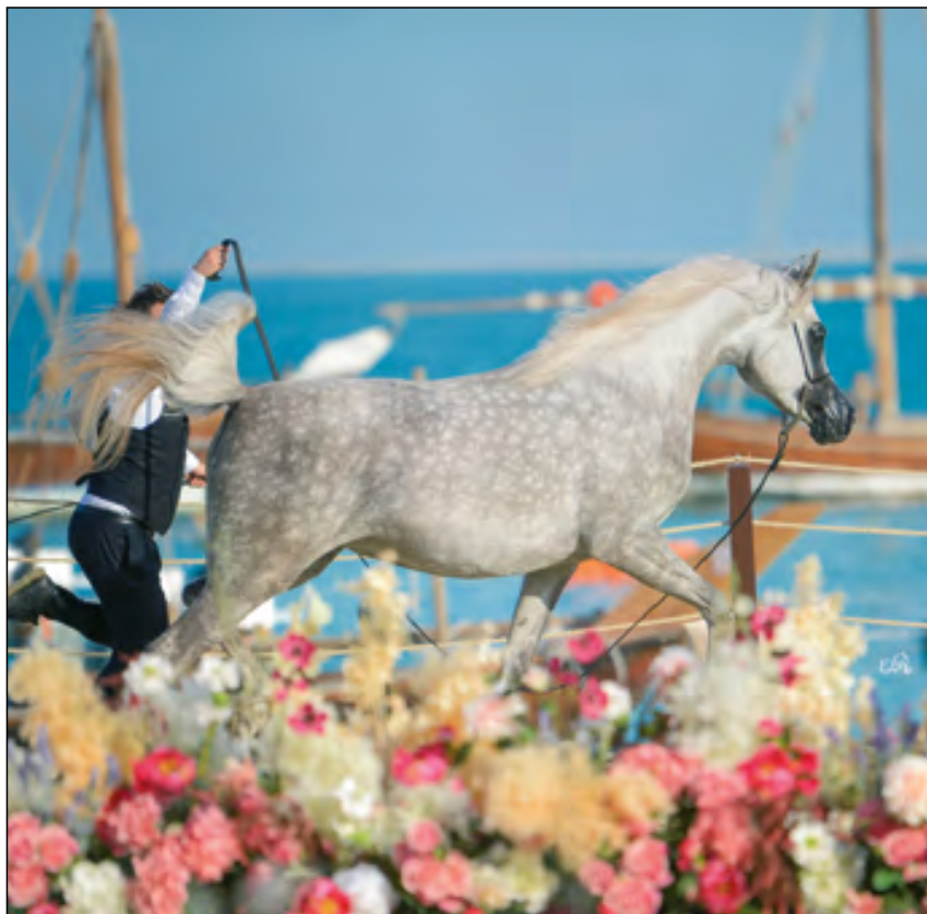
Emarella (Sahm El Arab x Emandorella)