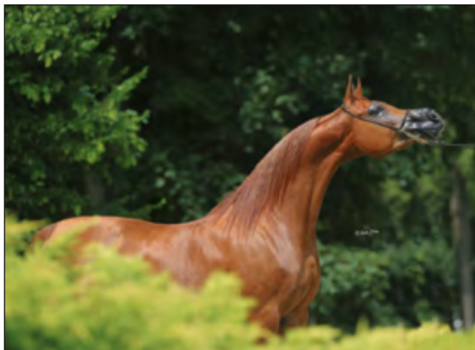
Paterna (Eden C x Pinga) Photo by Sylwia Itenda