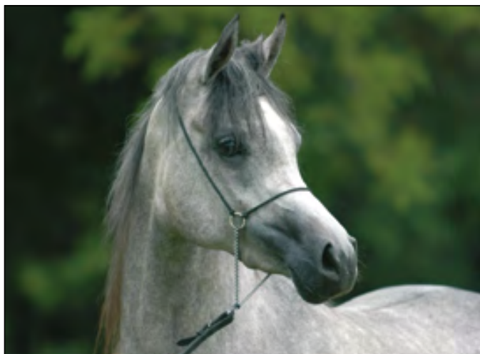
Emandoria as a two-year-old in Białka