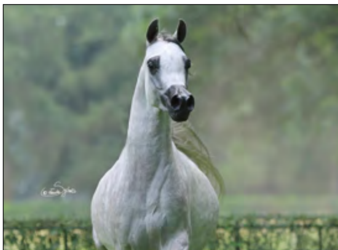
Pascuala (Ascot DD x Palmeta)