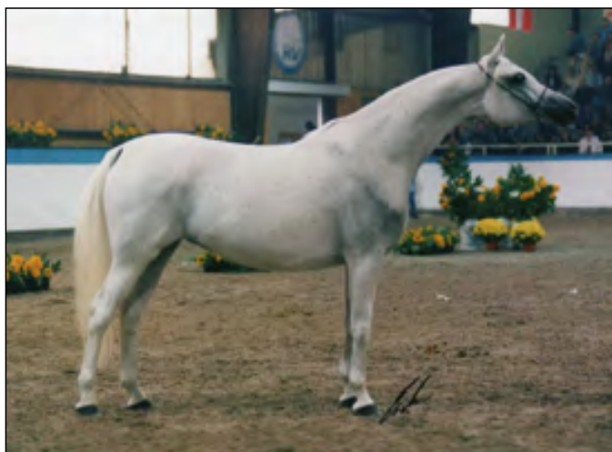
Emanacja (Eukaliptus x Emigracja) - Aachen 1998