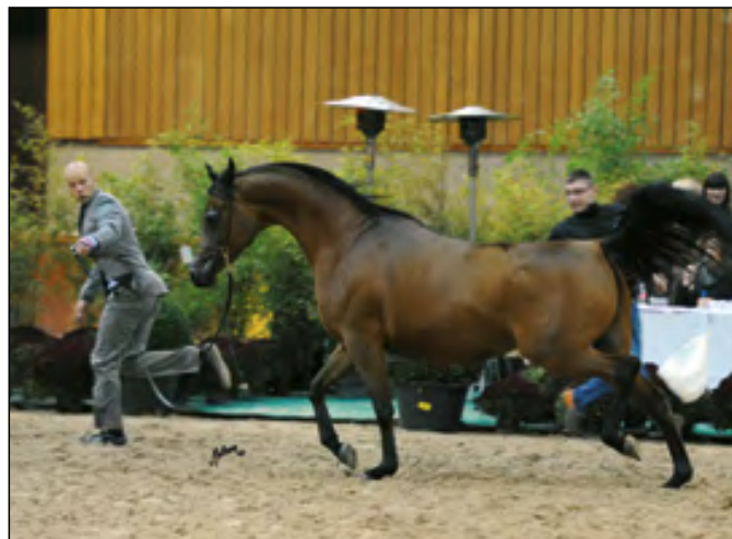
Pinga (Gazal Al Shaqab x Pilar) - Moorsele 2012