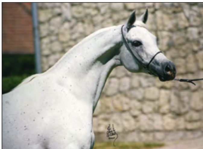
Emanacja (Eukaliptus x Emigracja)