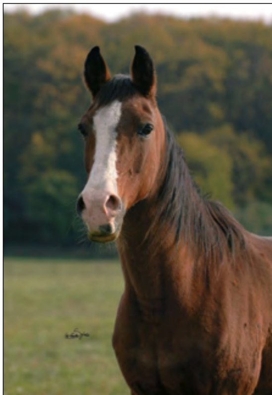
Pentoza at the age of 28