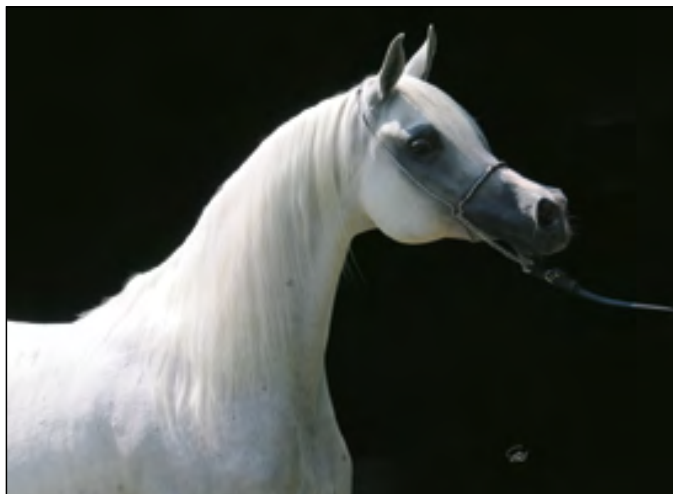
Emira (Laheeb x Embra)