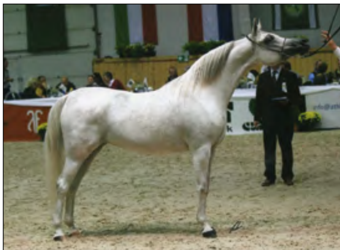
El Saghira (Galba x Emira) - Aachen 2012