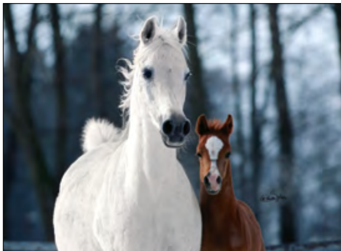
Palmeta (Ecaho x Pilica)