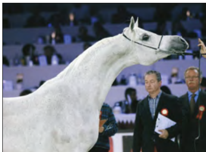
El Dorada (Sanadik El Shaklan x Emigrantka) - Paris 2011