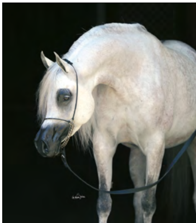
El Esmera (Sahm El Arab x Esmeraldia)