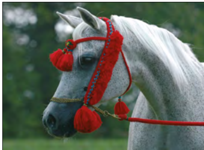
Emigracja at the age of 26