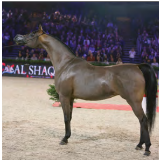
Pianissima (Gazal Al Shaqab x Pianosa) - Paris 2013