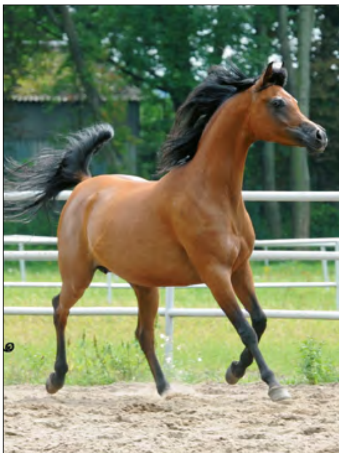
Pinga (Gazal Al Shaqab x Pilar)