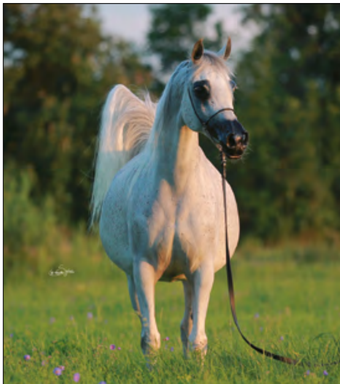
Emandorissa (Abha Qatar x Emanda)