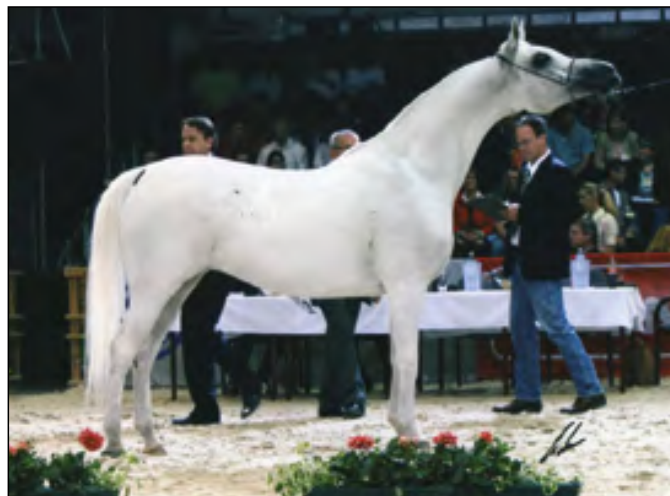
Emanda (Ecaho x Emanacja)