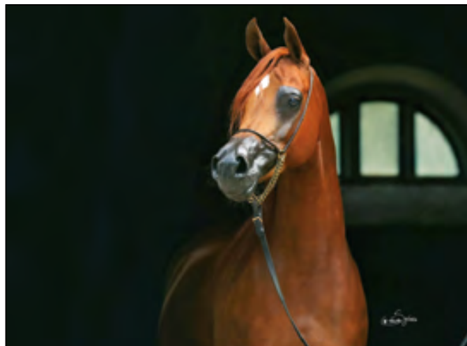
Paterna (Eden C x Pinga)