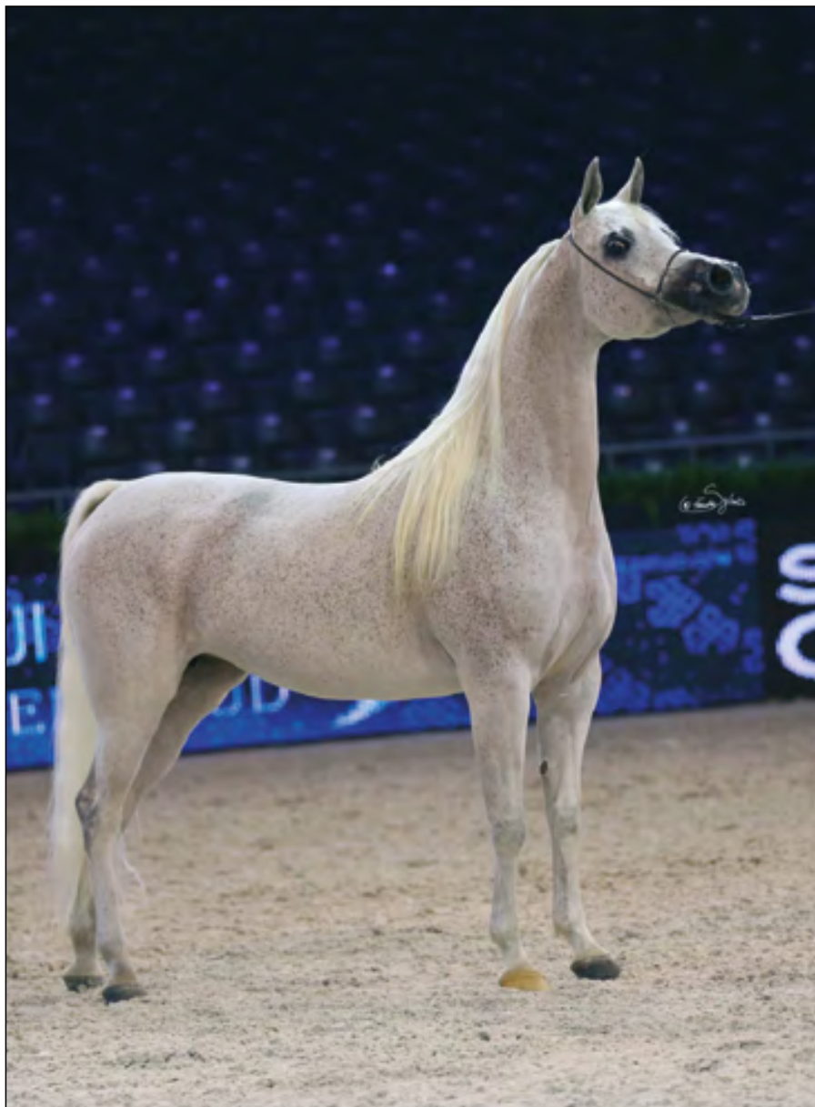
Emandoria (Gazal Al Shaqab x Emanda) - Paris 2013