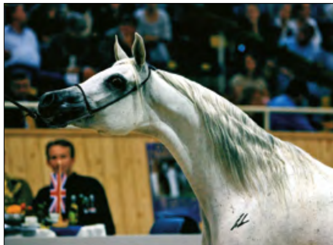
Embra (Monogramm x Emilda) Aachen 2006