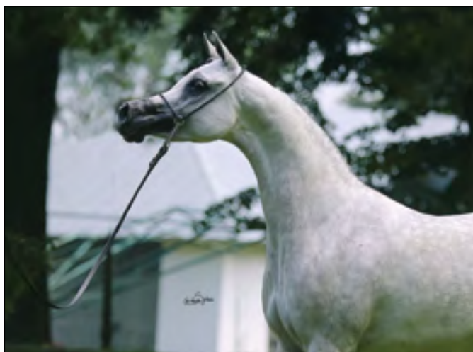
Pascuala (Ascot DD x Palmeta)