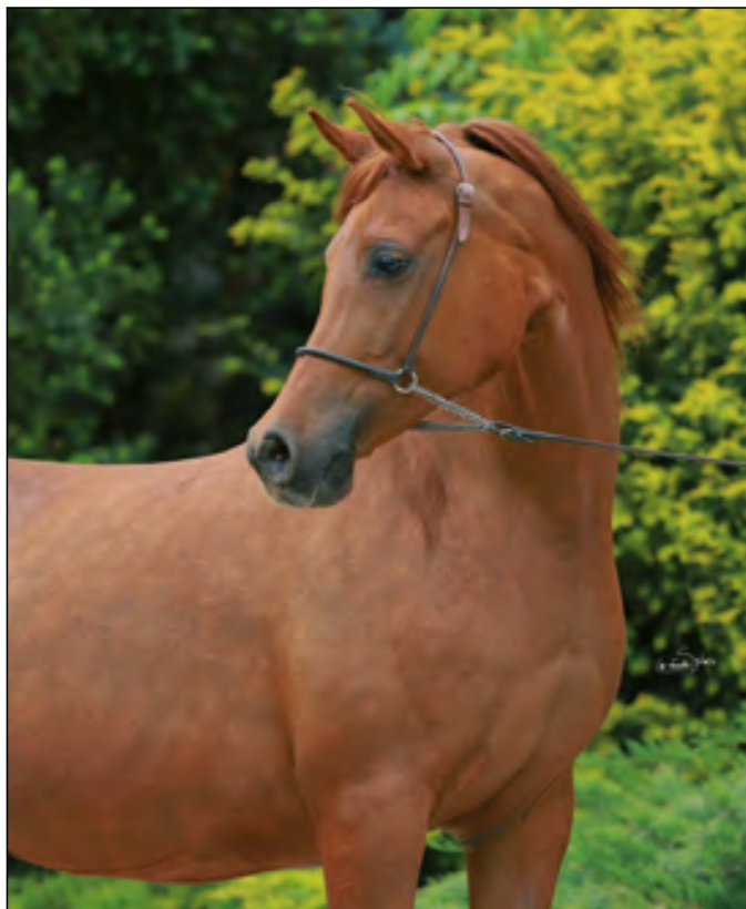
Ekliptyka (Ekstern x Ekspozycja)