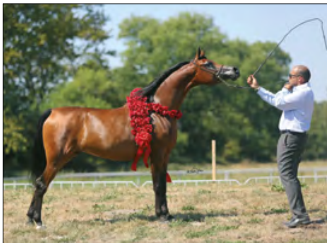
Piniata (Eden C x Pinga) - Polish Nationals 2015