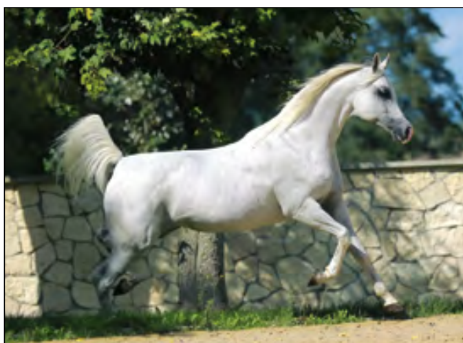
Emmona (Monogramm x Emilda)