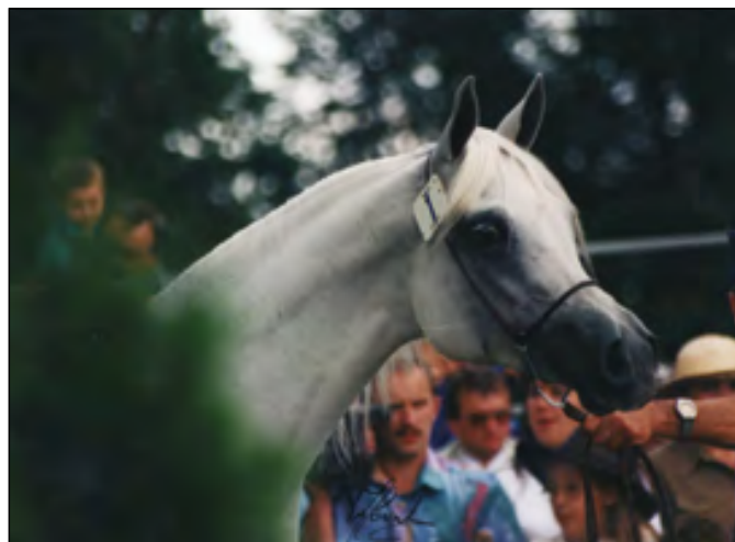
Emilda (Pamir x Emanacja)