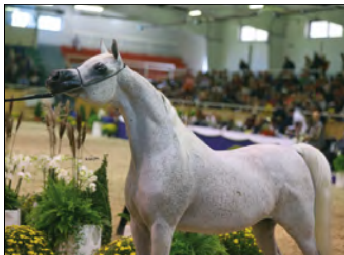
Emandoria (Gazal Al Shaqab x Emanda) - Aachen 2013