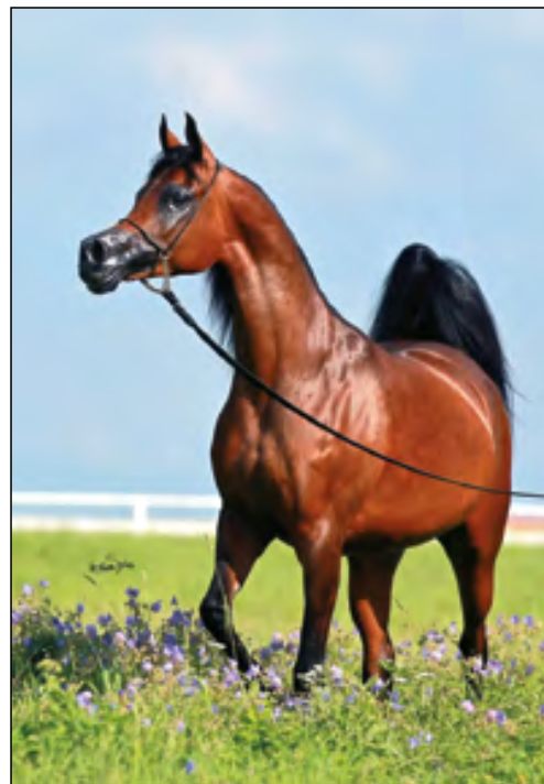
Emandilla (Om El Shahmaan x Espadrilla)

daughter, EMANDORELLA 2012, the dam of EMARELLA 2018 (by Sahm El Arab 2013), 2021 Qatari National Gold Champion Junior Filly, or the full sister to EMERALD J, ESMERALDIA 2013, the dam of EL ESMERA 2018 (also by Sahm El Arab), 2021 European Gold Champion Junior Filly, just recently crowned 2022 Polish National Gold Champion Senior Mare and Best in Show in Janów Podlaski. These two sensational young mares are the sixth generation of the champion making family, started by EMIGRACJA. While only considering numbers, EMANDA mostly produced stallions that played a minimal role in breeding, however when she produced a mare, the result was no less than spectacular. Her