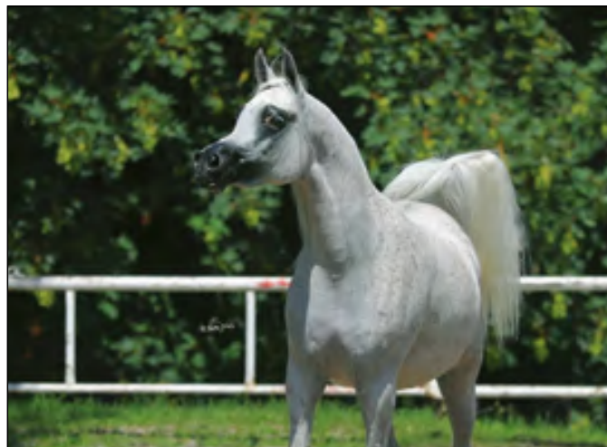
El Medonia (Shanghai EA x El Medina)