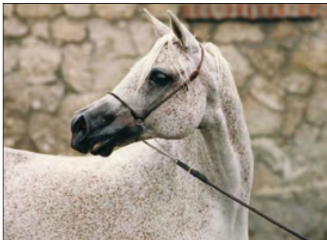
Emigracja (Palas x Emisja)