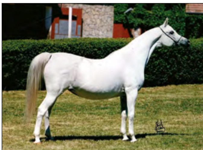
Emigrantka (Eukaliptus x Emigracja)