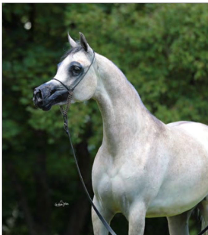
El Medida (Morion x El Medara)