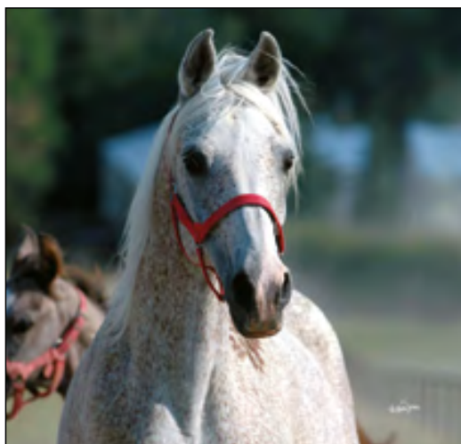
Perforacja (Ernal x Pentoza)