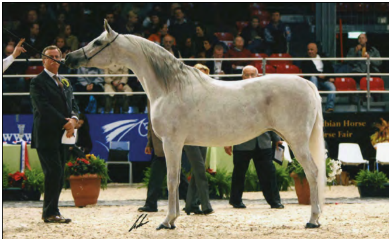
Embra (Monogramm x Emilda) Paris 2006

EMMONA followed in her dam's footsteps, joining the broodmare band of Halsdon Arabians. Shirley and Charlie Watts paid 45 000 EUR for the then 19-year-old mare whose most renowned progeny is the dark bay GAZAL AL SHAQAB 1995 son, ERYKS 2003. EMILDA's full sister, EMANTA 1991, sold to Falborek Arabians for the then record price on the Polish market – 70 000 USD, produced one of the most beautiful mares ever bred by the Polish private breeders, the exquisite grey EKSTERN 1994 daughter, EKSTERNA 2005, the dam of 2020 Polish National Gold Champion Senior Stallion, EMPOWER 2015 (by WH Justice 1999). What is more, EMANACJA produced valuable