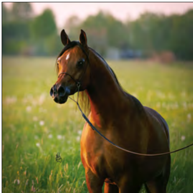
Ejrene (Gazal Al Shaqab x Emocja)