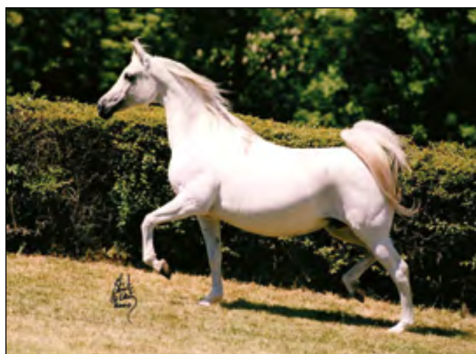
Emigrantka (Eukaliptus x Emigracja) Photo by Stuart Vesty