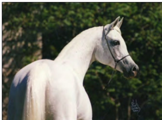
Emanacja (Eukaliptus x Emigracja)