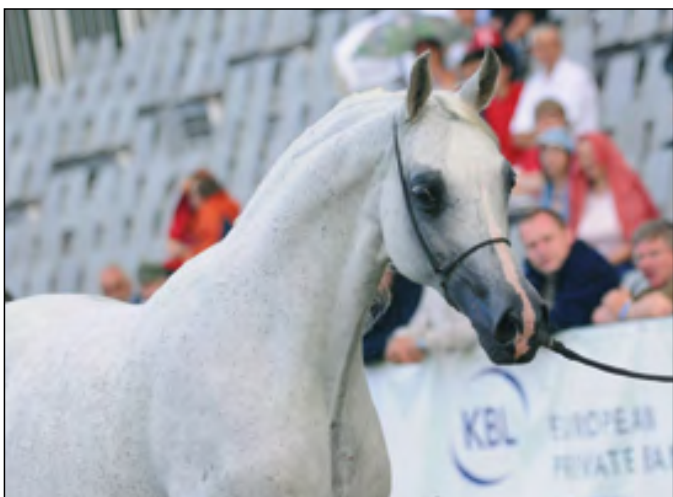
Egzonera (Monogramm x Egzotyka)